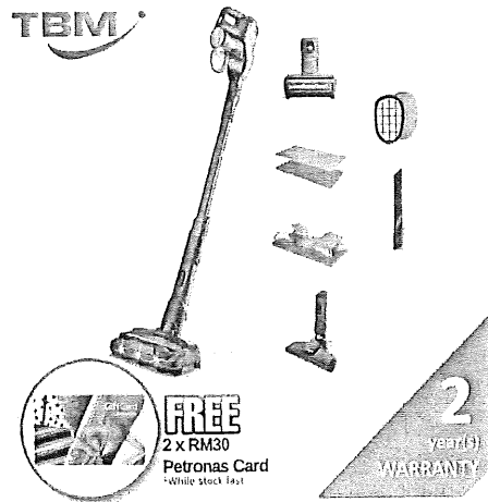
Figure 2: Cordless vacuum